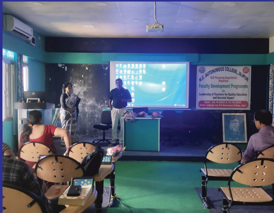
FACULTY DEVELOPMENT PROGRAMME